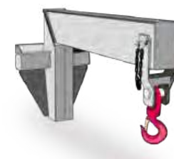
Reduced Height Hook