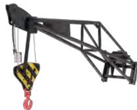
Fly Jib with Winch