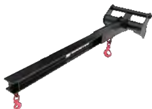
P6000 Jib Extension